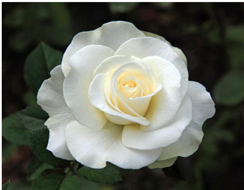
‘Randy Scott’ Hybrid Tea Rose - Photographed in Natural Outdoor Late Afternoon Light Nikon D700, Tamron 28-300mm Lens, Focal Length = 170mm; f/11, 1/350 sec, ISO=640

Cameras and Lenses: Almost any photographer with almost any camera and lens can take a good picture of roses at a distance while composing a nice landscape scene. But as you get closer to the rose, and especially for close up photos of the rose, the camera and lens combination and the photographer's use of good photographic techniques can make a significant difference in the quality of the photo.