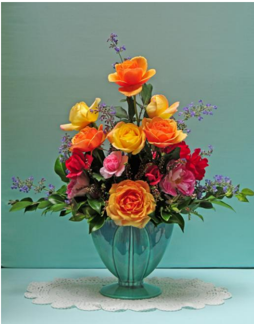
Arrangement by Terry Palise

Here in photos taken indoors, the colors are good/accurate.