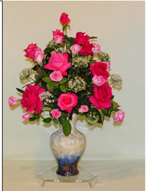
Arrangement by Nancy Redington

Here the in-camera flash => was used and subtle (but acceptable) shadows can be seen behind, down and below the flowers on the wall in the niche. The photo was taken as a horizontal photo to keep the flash unit above the display. Later was cropped to vertical.